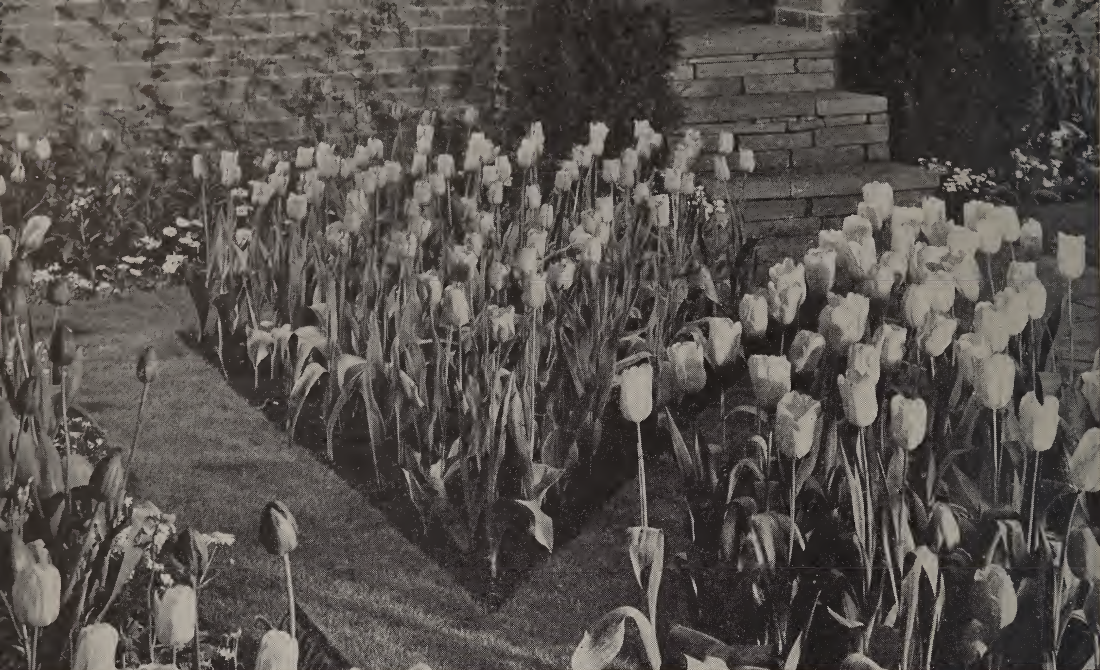
A partial view of our Spring Garden at the International Flower Show in the Grand Central Palace, New York City, March, 1938, which was awarded the Sweepstake Trophy in the large garden class.